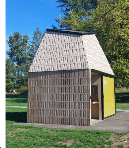
Image of washroom facility at Forsyth Park